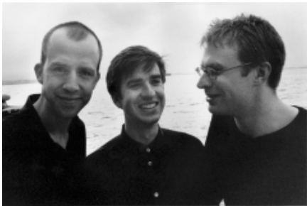
New Power Trio

This group is described as "catchy songs with delightful solos ... Fans seeking unusual, fresh approaches to jazz and Latin music shouldn't miss [the NPT]..." -Nashville Scene